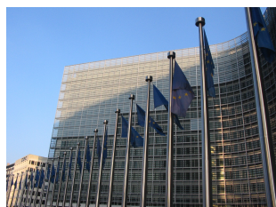
The European Commission in Brussels

In November 2011, the European Commission proposed to merge the different programmes for education, youth and sport under the name of ‘Erasmus for all’. Grundtvig, the adult education programme belongs to the 7 programmes affected by this reorganization.