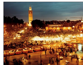
Marrakech

The World Committee for Lifelong Learning organises its 3 rd World Forum in Marrakech on the 31 st October, the 1 st and 2 nd November 2012. The forum, entitled “Learn throughout life, why and how?” is organized in partnership with UIL, ICAE and the Moroccan authorities. Innovative workshops and prestigious guests will probably turn this forum into a key moment of the year 2012.