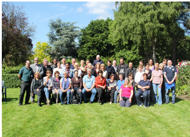
Group picture

The Tutors Scientific Committee, the Consortium and the Learners Scientific Committee worked separately but also in plenary to decide the format of the publications, finalize its content and talk about other important matters related to the Bonn conference and the future of the network.