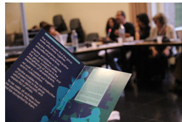
Working on the publications

Without any doubt, there were three hard-working days but we didn't miss out on laughters and good times. After a lively dinner in the city centre to end the meeting, the partners said goodbye, knowing that they will see each other very shortly.