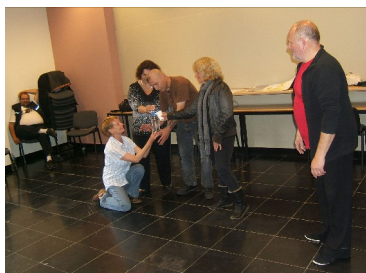
Action Theatre

The learners had a great diversity of tasks and the most multilingual ones. With the help of a community theatre professional, they prepared a play to bring their Manifesto to life. Their work, done in five languages, required a bilingual facilitator, French-English interpreters and support persons for Spanish, Dutch and German.