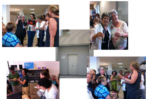
The inauguration party at the new office

Last 10 th July, FACEPA moved to a new office in Barcelona. Learners, friends and the associations that share the facilities with FACEPA came to the inauguration party.