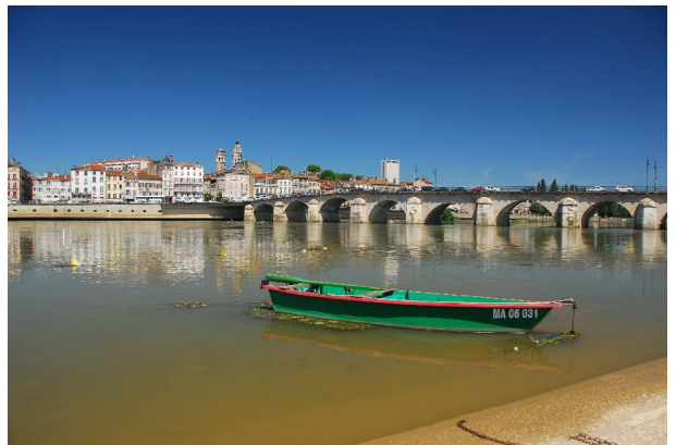
The Saône river in Mâcon

"Literacy and Numeracy: Examples of good practices for learners self-determination" - Mâcon, France.