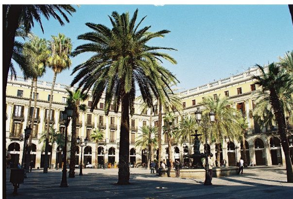
Plaça Reial, Barcelona

interested learners. Application must be made before 15 May .