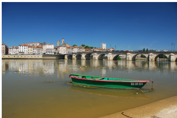
The Saône river in Mâcon

Organised by AEFTI, this workshop aims at selecting, testing, trying out and discovering pedagogical practices facilitating the learners self-determination.