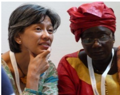
ICAE WA 2011 Photos

“A world worth living in - Adult learning and education: a key to transformation”